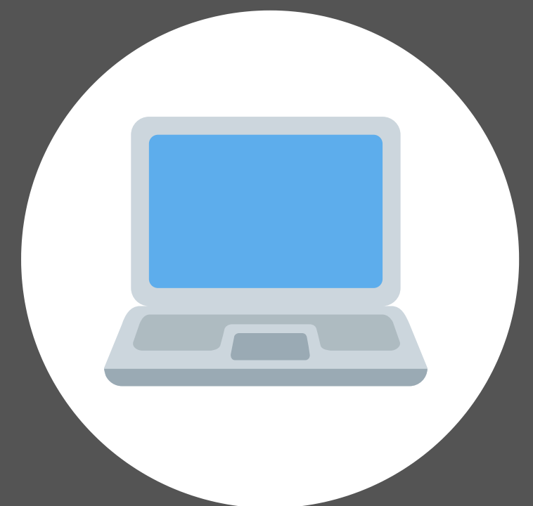
Virtual Dojo Option

Students, staff and visitors will be required to adhere to all public health guidelines and extended safety protocols