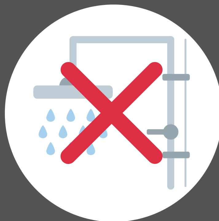
No changeroom access