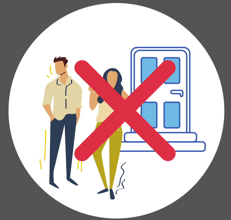
Limited Access (Students and staff)