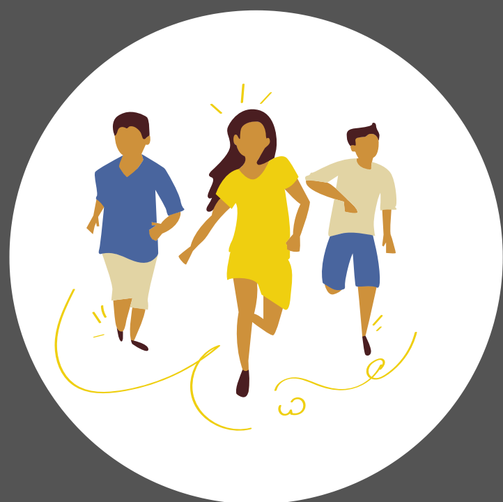
Restricted Class Size (online pre -registration)