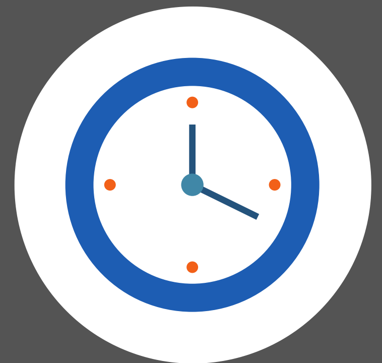
15 mins between classes