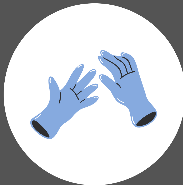
Increased Cleaning Procedures