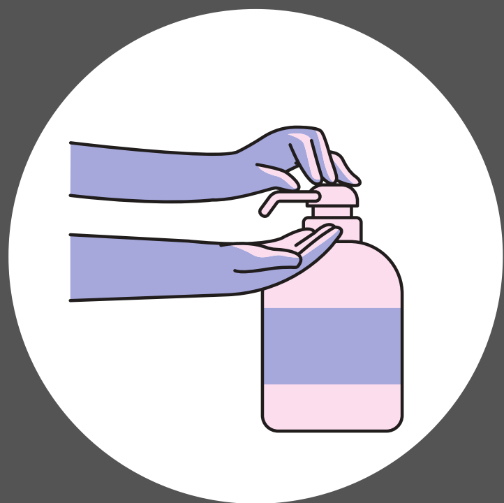
Hygiene - hand washing between classes